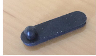
rounded, recessed pad with 1 stem Standard capos 2013-present

You will need some cyanoacrylate adhesive (super glue, or crazy glue). And it's a good idea to have a paper towel handy.