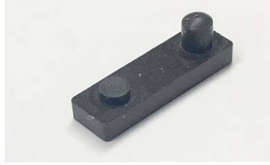
rectangular pad with 2 stems Standard capos 2005-2012 Deluxe and Lite capos 2005-present