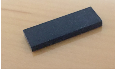
Flat, rectangular die-cut pad All capos prior to 2004

Depending on when your capo was made, one of these pads fits it. It should be apparent from looking at the capo, which pad you should be using. When in doubt, we'll send you all three.