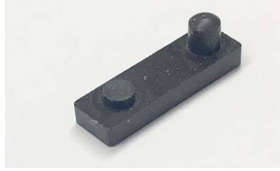
Rectangular pad with 2 stems: Standard capos 2005-2012 Deluxe, Original, and Lite capos 2005-present